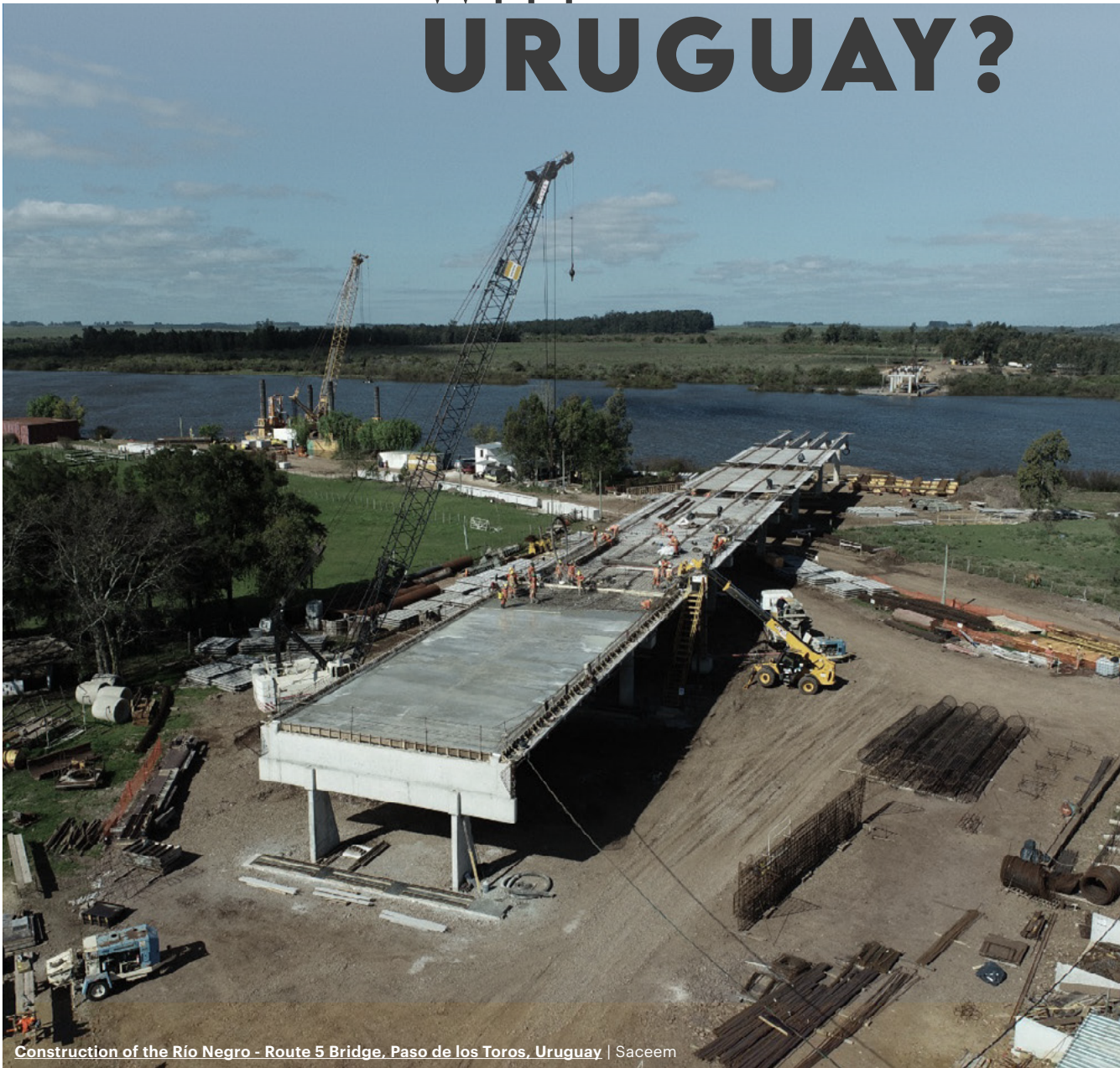
Construction of the Río Negro - Route 5 Bridge, Paso de los Toros, Uruguay | Saceem