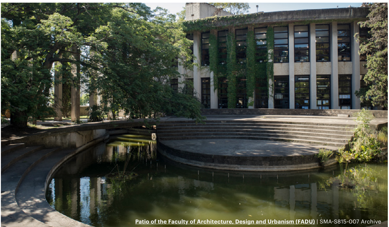
Patio of the Faculty of Architecture, Design and Urbanism (FADU)

“My first trip to Uruguay was an eye-opener. I had no idea that this small country had so much to offer. From the impressive universities, the entrepreneurial spirit, and the magnificent coastline, it’s clear that Uruguay is ready to step onto the world stage.”